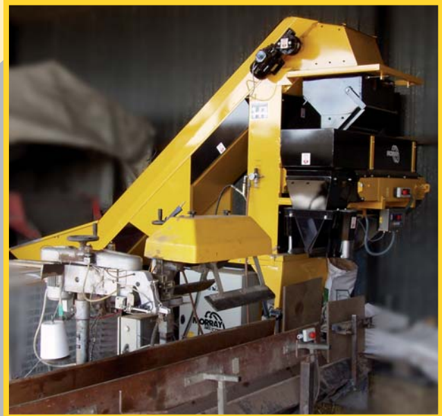
M550 working with a NP7 Sewing head