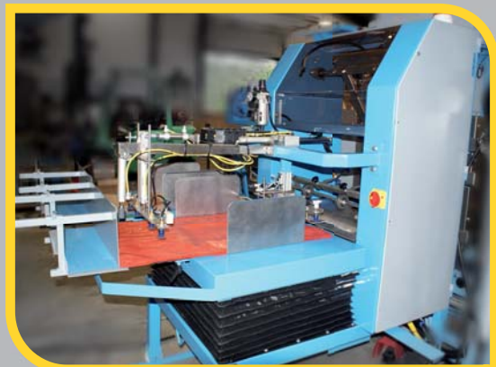
WASP Sackplacer operating with a M602